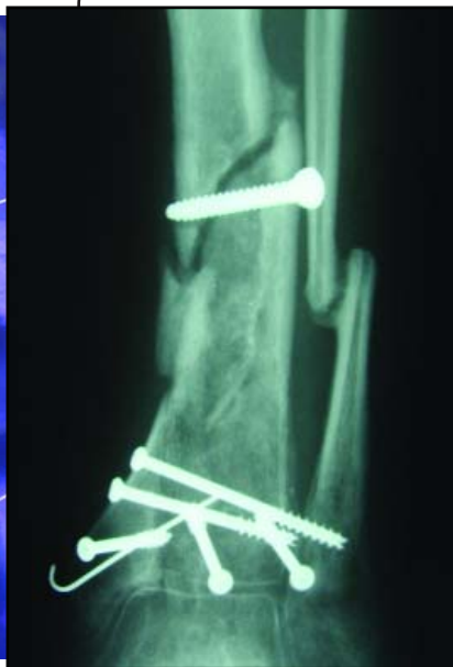
Figure 1 | pre-op