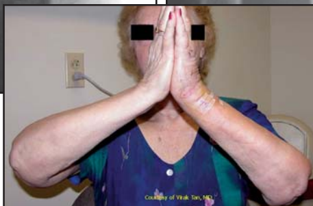
Range of Motion at just 2 weeks